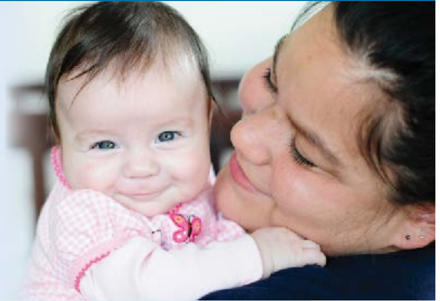
featuring mother and daughter from YWCA Crabtree Corner.

This overview of financial literacy and Aboriginal peoples is based on insights from expert practitioners and TD Financial Literacy Grant Fund recipients serving Aboriginal communities. Its purpose is to share knowledge on the financial literacy needs of Aboriginal peoples and how best to meet them.