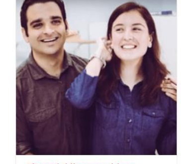
Financial literacy videos View videos on a variety of financial topics.