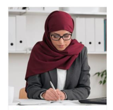
Financial wellness checklist

Answer the ten questions to assess which financial topics you need to learn more about.